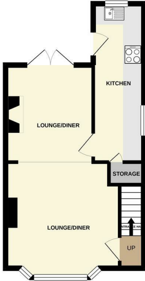
GROUND FLOOR 366 sq.ft. (34.0 sq.m.) approx.